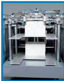
Paper feeding system.