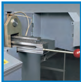
Punching tool location.