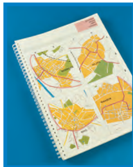
Sample bound using the WB-450.