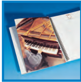
Sample bound using the WB-450.