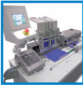
Touch screen and closing system.